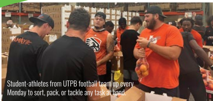
Student-athletes from UTPB football team up every Monday to sort, pack, or tackle any task at hand.

Every Monday, rain or shine, the University of Texas Permian Basin Football team arrives at the West Texas Food Bank determined to help neighbors who are facing hunger.