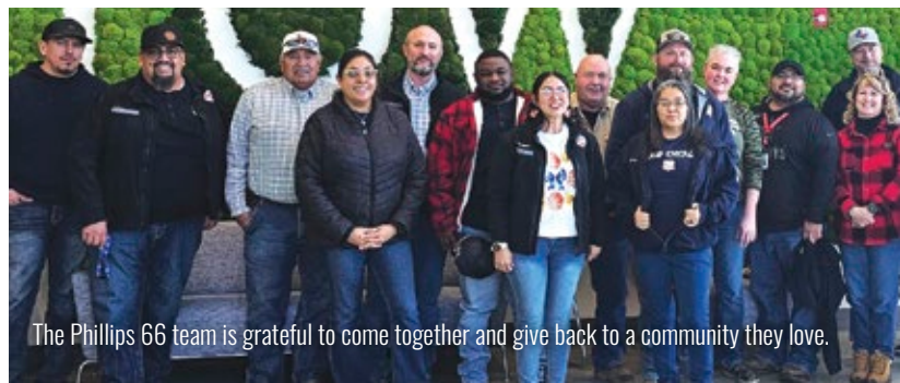
The Phillips 66 team is grateful to come together and give back to a community they love.

We are grateful for Phillips 66 and every volunteer who gives their time to the Food Bank. Together, we are making a lasting difference in the fight to end hunger.